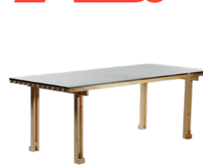
Dining Table 198×91.5×73 cm; 32.5 kg Pages 26 and 27

Made out of pinewood and a two-millimetre stainless steel sheet. It is very easy to clean. ;) No shipping, pick up only.