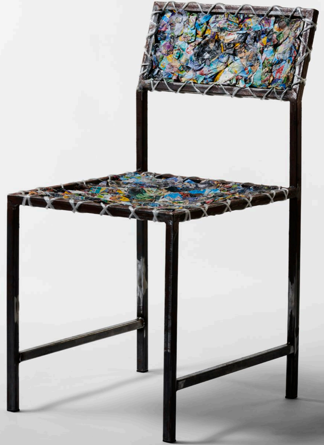
METAL CHAIR (PAPER SEATING) 43x54x84 CM