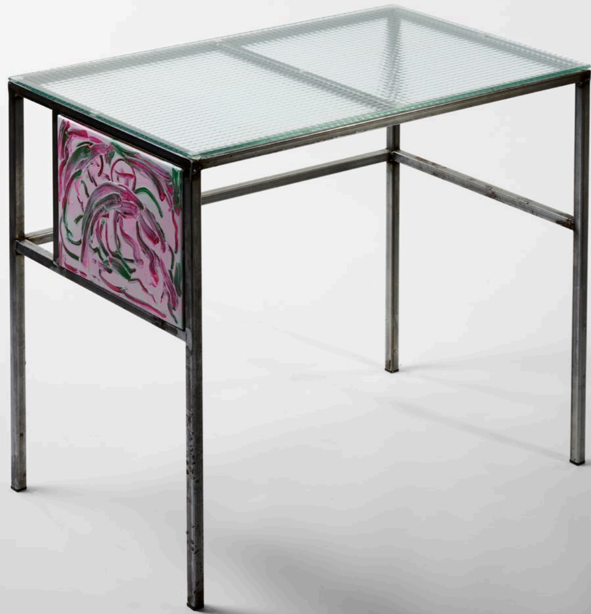
SMALL DESK (MULTICOLOUR MM LOGO) 86x51x73 CM