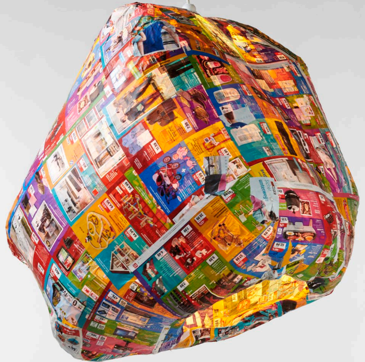
HOLLOW STONE HANGING LAMP 75x75x75 CM