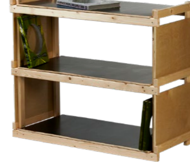
Modular Shelf 100×45×84 cm each; 14.7 kg each Pages 30, 31, 32 and 33

The price is for one unit, as shown on the image above. Depending on the number of units, they can be used as a sideboard or a bookshelf or some sort of tower. The shelf tiers (32 cm high) are bigger than those of an average bookshelf. They are very practical for clothes or vinyl records (if you are one of those people). Transparent storage boxes also fit.