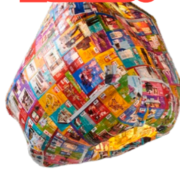
Hollow Stone Hanging Lamp 75×75×75 cm; 1 kg Page 21

Made from advertising catalogues received in the mail. They are glued with wallpaper paste to a recycled chicken wire mesh. They are not good lamps to read a book with, but you'll get nice ambient light out of them. An LED light bulb is included. Please use only LED light bulbs. Weight, size and colour may vary.