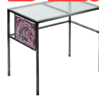
Small Desk (Multicolour MM logo) 86×51×73 cm; 16.5 kg Page 28

The desk trays were originally made with wire mesh. This was abandoned because everything vibrated in a very unpleasant way when typing on a laptop. The desk trays are now made of safety glass. They are joined to the metal structures with used nicotine chewing gums. Logo will vary. No shipping, pick up only.