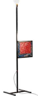
Inverted F Standing Lamp (Freestyle MM Logo) 57×36×169 cm; 4.7 kg Page 23 and backcover

They come with an LED light bulb, honey. Logo will vary. Shipping restrictions apply.