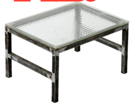
Small Coffee Table 40×30×22 cm; 4.8 kg Page 29 and backcover

The table trays are made of safety glass. They are joined to the metal structure with used nicotine chewing gums. We find that coffee tables are always too big and end up being covered in crap.