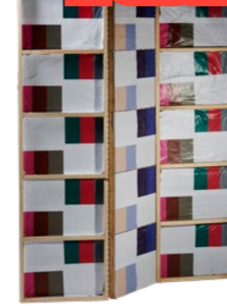
Screen 150×4.5×175 cm; 12 kg

Pages 51, 52 and backcover Made, for the most part, of wood, chicken wire mesh and paper. Here, the papers used are maculatures (wasted prints, basically) from Maximage Color Combinations . It's a fancy book. Maculatures will vary. Shipping restrictions apply.