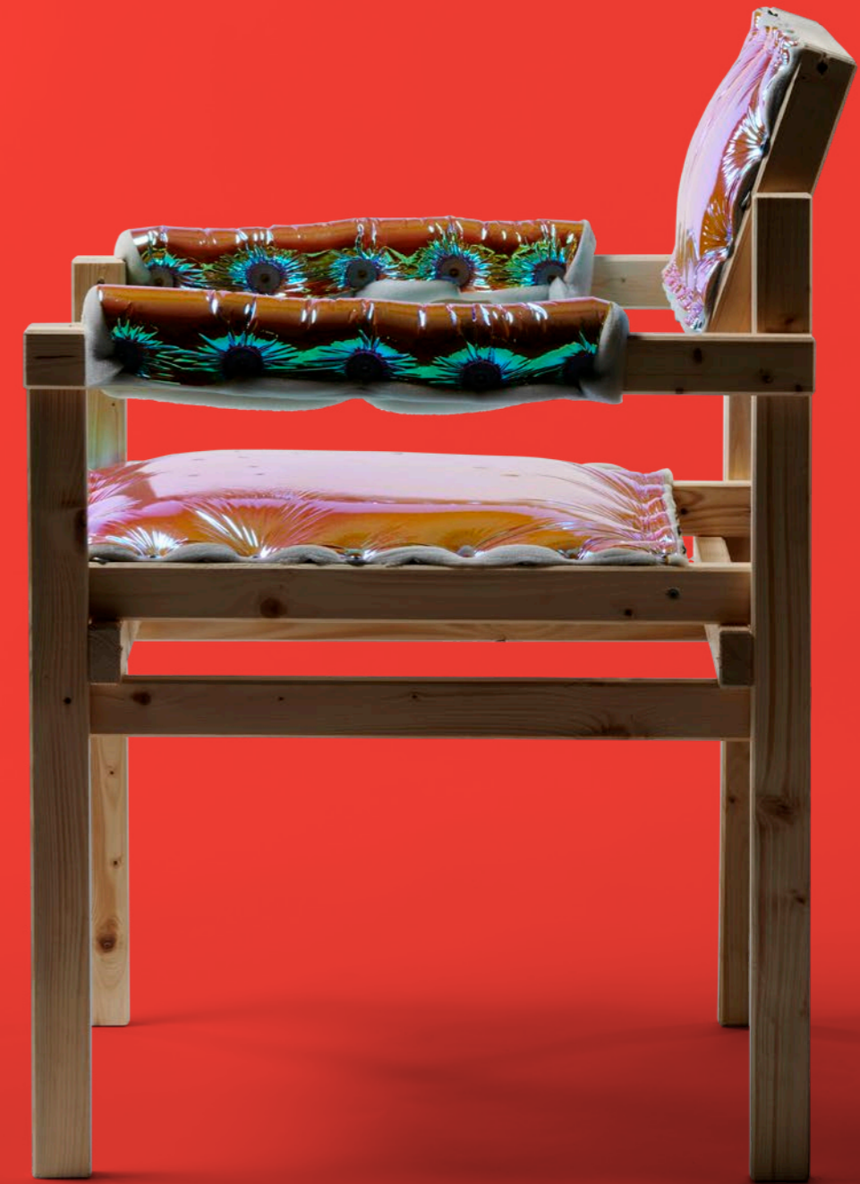
ARMCHAIR (IRIDESCENT LAYER AND FOAM SEATING) 61x62x85 CM