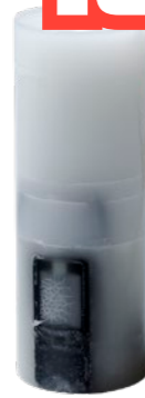
Living Room Speaker 55×40×55 cm each; 3.4 kg each Pages 36 and 37

Hi, new friend. Speakers are custom-made from used or new membranes. The sound is pretty good on this one. Please contact us for bespoke advice. Weight, size, colour and price may vary. In this example, the indicated price is for one speaker.