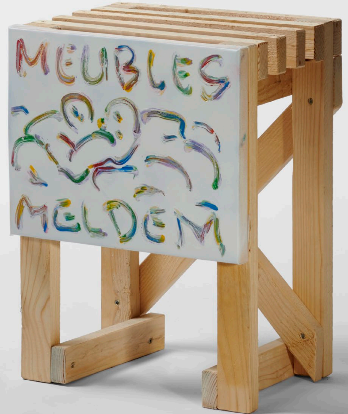
STOOL (MULTICOLOUR MM LOGO) 34x27x46 CM