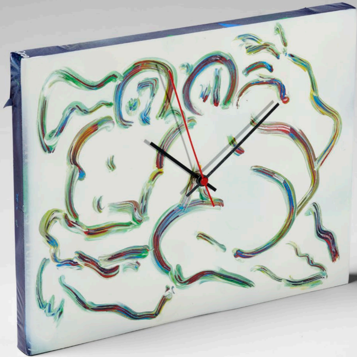
WALL CLOCK (MULTICOLOUR MM LOGO) 33.5x4x26.5 CM