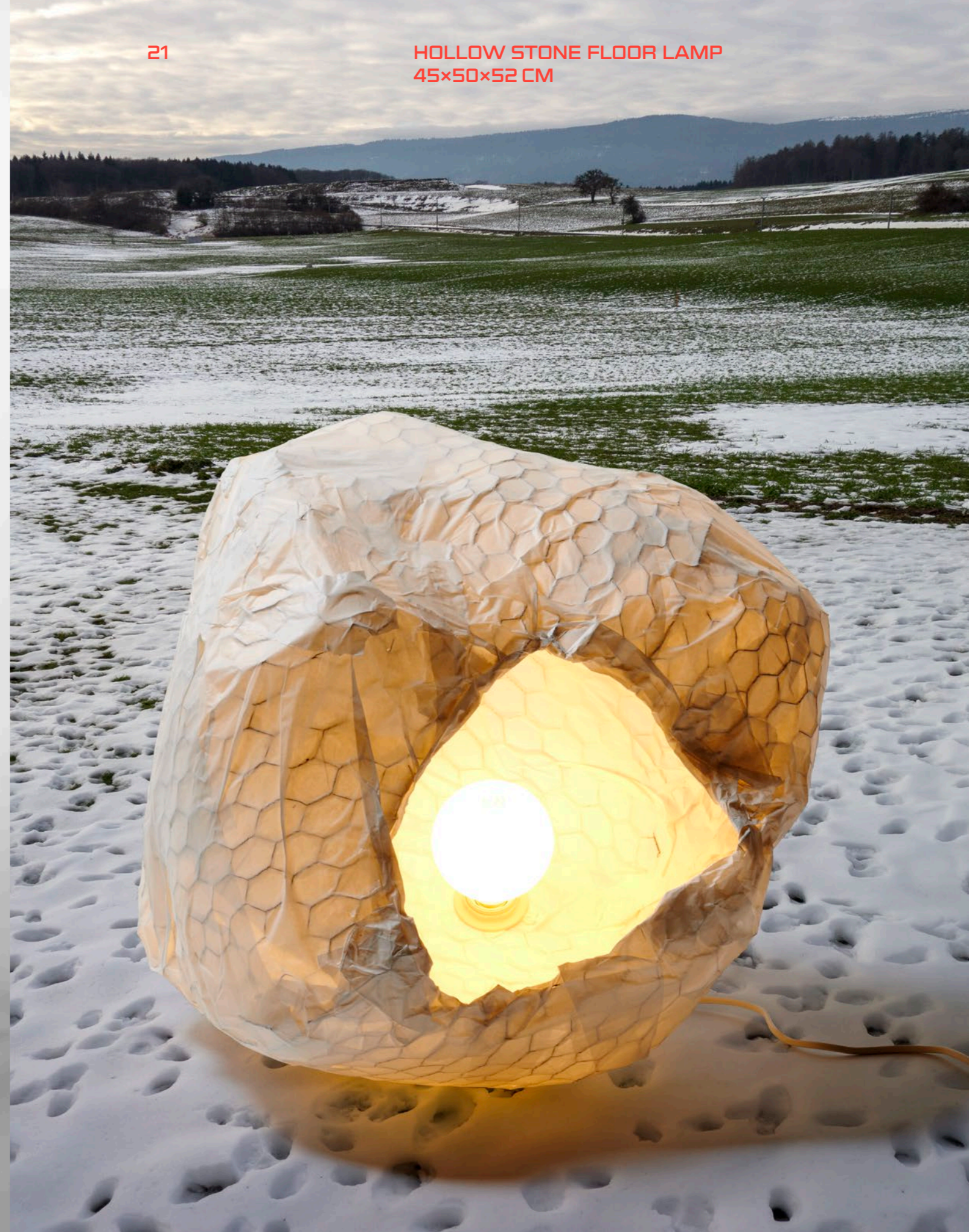
HOLLOW STONE FLOOR LAMP 45x50x52 CM