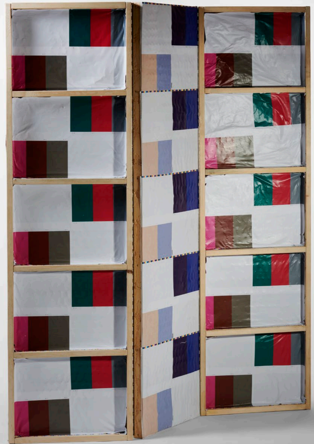
SCREEN 150x4.5x175 CM