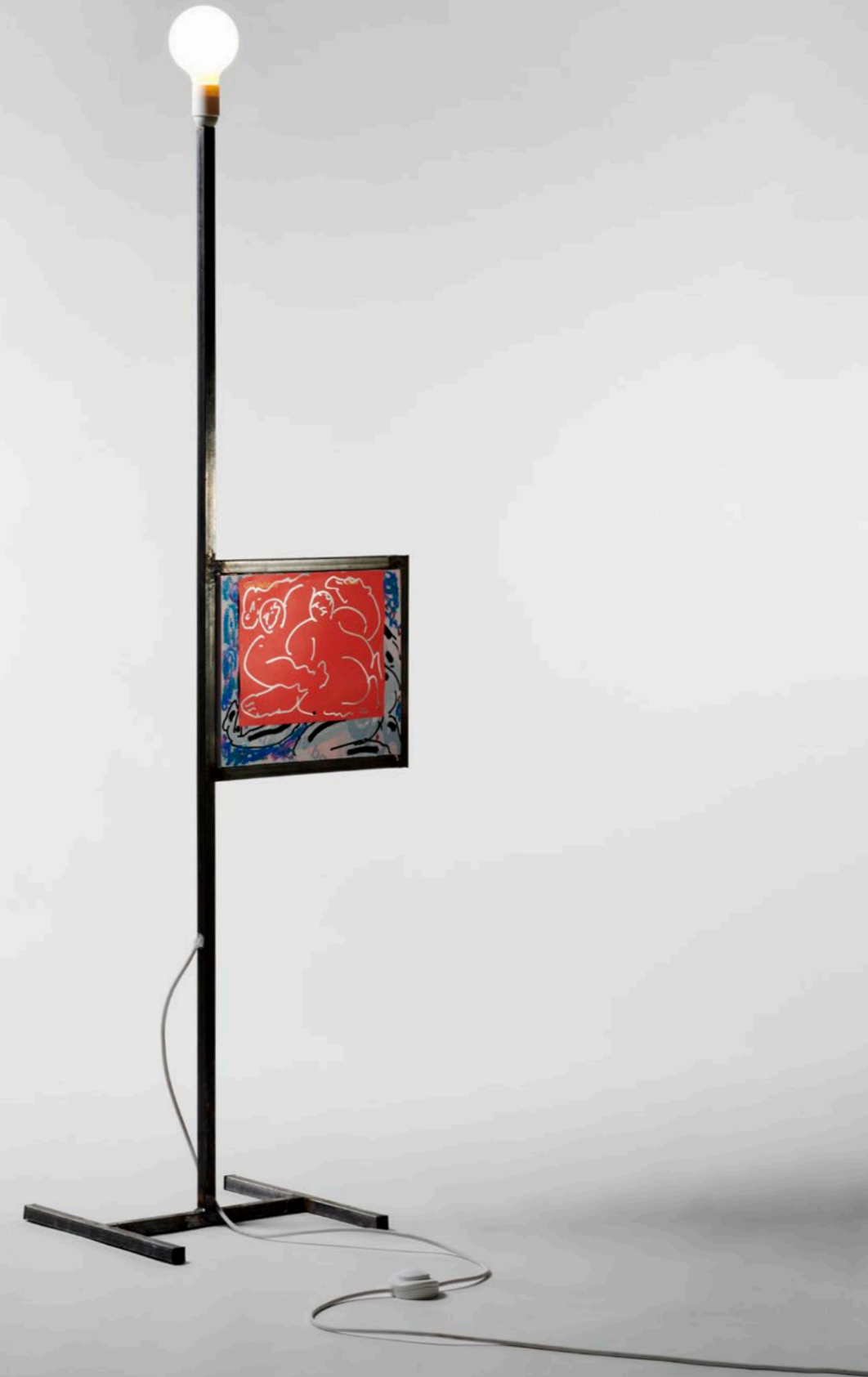
INVERTED F STANDING LAMP (FREESTYLE MM LOGO) 57x36x169 CM