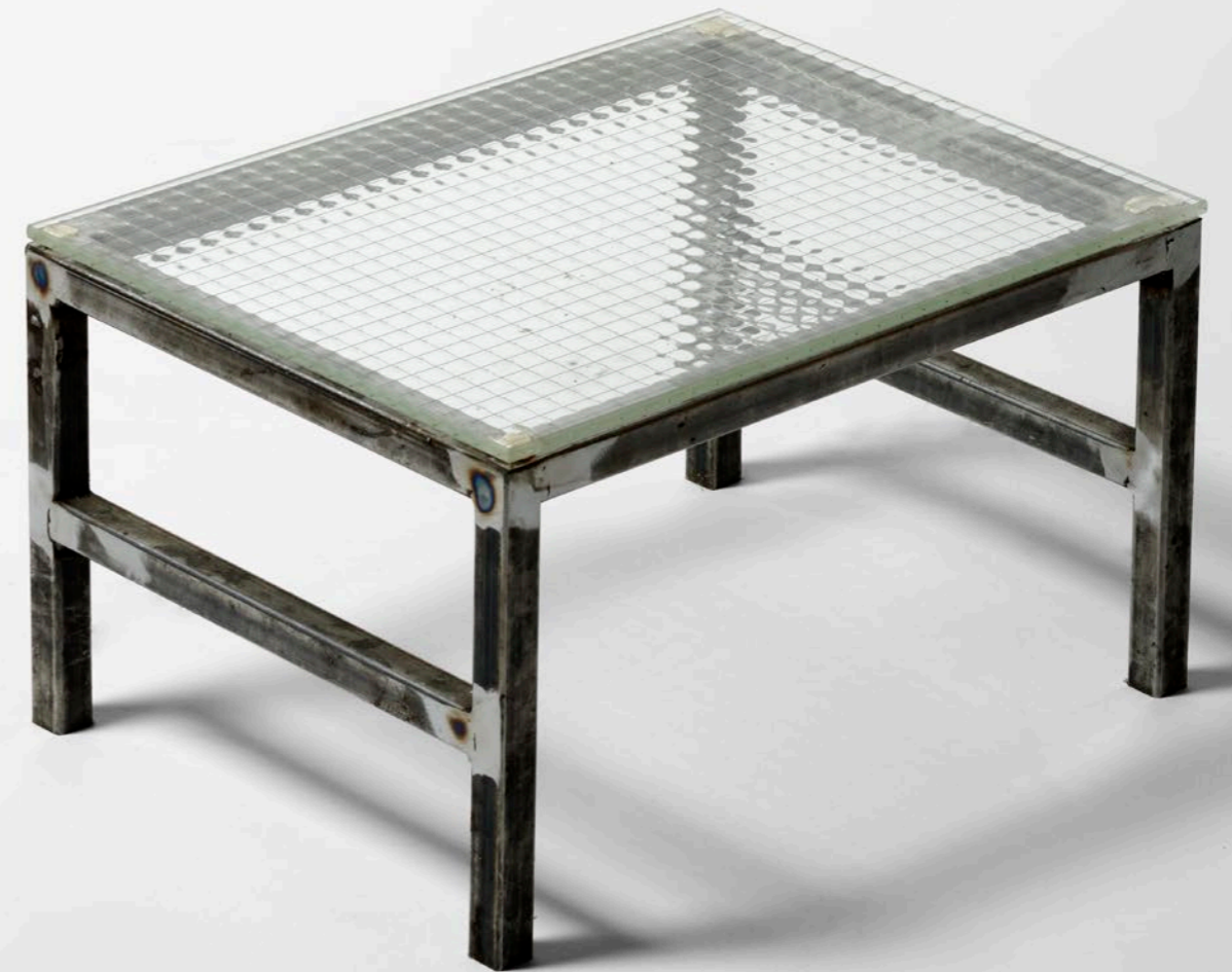
SMALL COFFEE TABLE 40x30x22 CM