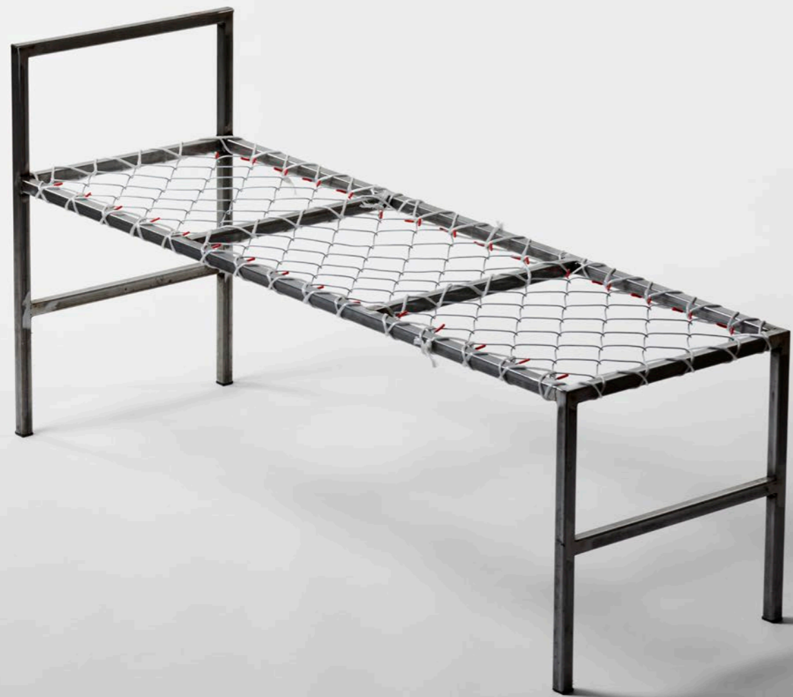
ENTRANCE BENCH (EXPOSED DIAMOND MESH SEATING) 120x40x60 CM