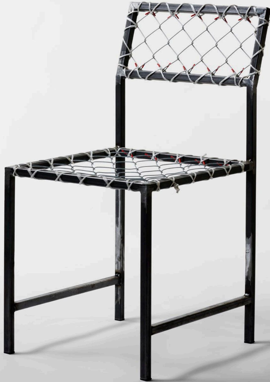
METAL CHAIR (EXPOSED DIAMOND MESH SEATING) 43x54x84 CM