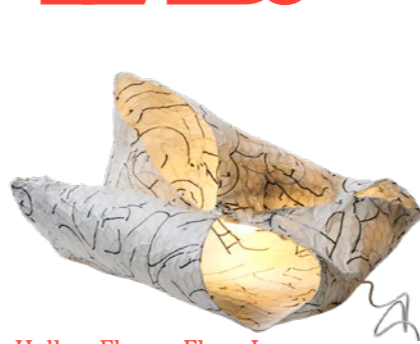
Hollow Flower Floor Lamp (B&W MM logo) 90×66×42 cm; 0.7 kg Page 22

Made of very thin paper used to separate printing plates in print shops. Our logo is drawn on every sheet with a permanent marker. The paper is glued to a flower-shaped chicken wire mesh. An LED light bulb is included. Please use only LED light bulbs. Weight and size may vary.