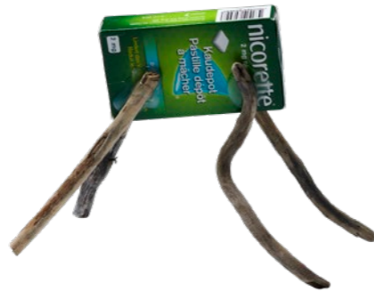
Dog Trinket (Medication) 25×15×25 cm; 0.1 kg Pages 42, 43 and 44

Made of driftwood found on Lemnan Lake beaches and found or used empty medication packages. Medications will vary. Weight and size may vary.