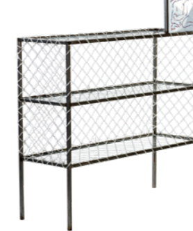
Metal Shelf (Multicolour MM Logo) 125×41×137 cm; 19 kg Pages 34 and 35

If you are a book fetishist, you might want to consider not buying these shelves. With time, the wire mesh will probably make tiny little dents on the bottom edge of your books. We suggest that you place a pillow between the mesh and your books to avoid this carnage. Logo is painted on reflex coating and will vary. Shipping restrictions apply.