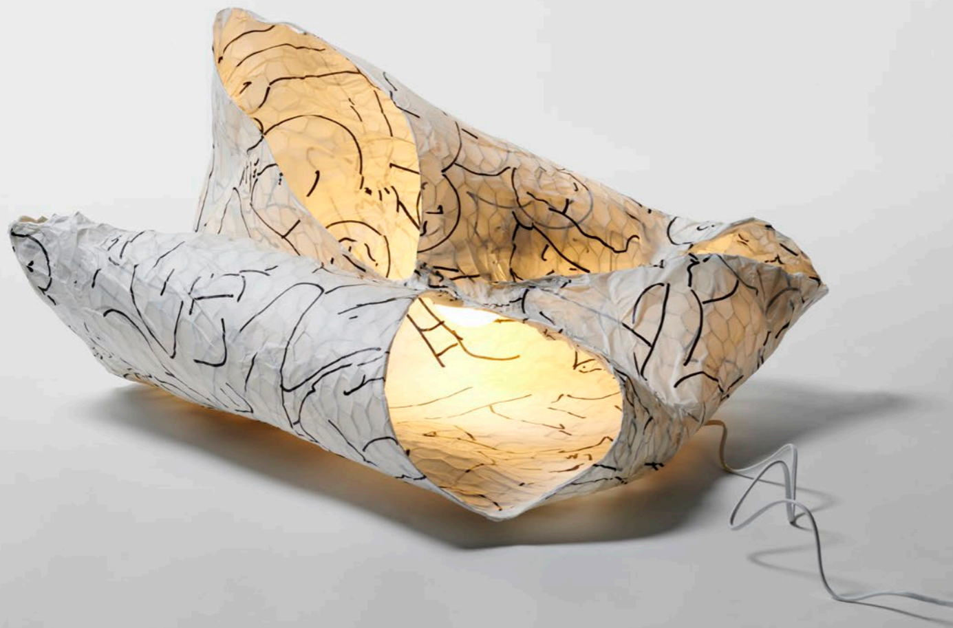
HOLLOW FLOWER FLOOR LAMP (B&W MM LOGO) 90x66x42 CM