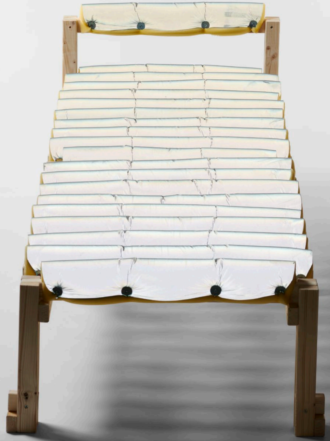
DAYBED 200x72x61 CM