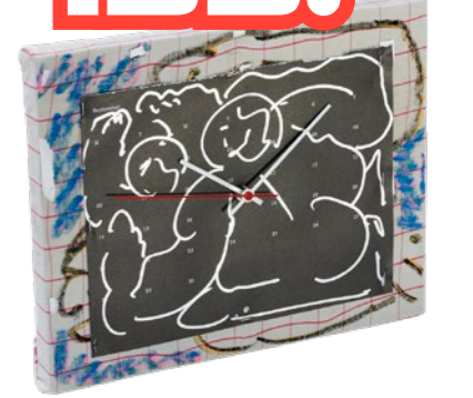
Wall Clock (Freestyle MM Logo) 33.5×4×26.5 cm; 0.7 kg Page 49

Made of whatever stuff we could find handy. They contain clockwork run by one AA battery (not included). Logo will vary.