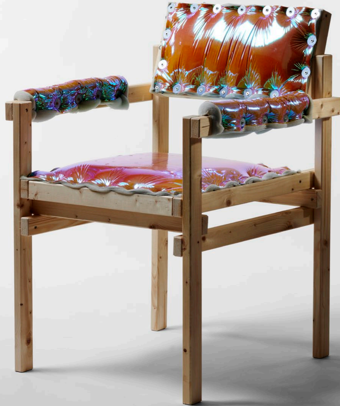
ARMCHAIR (IRIDESCENT LAYER AND FOAM SEATING) 61x62x85 CM