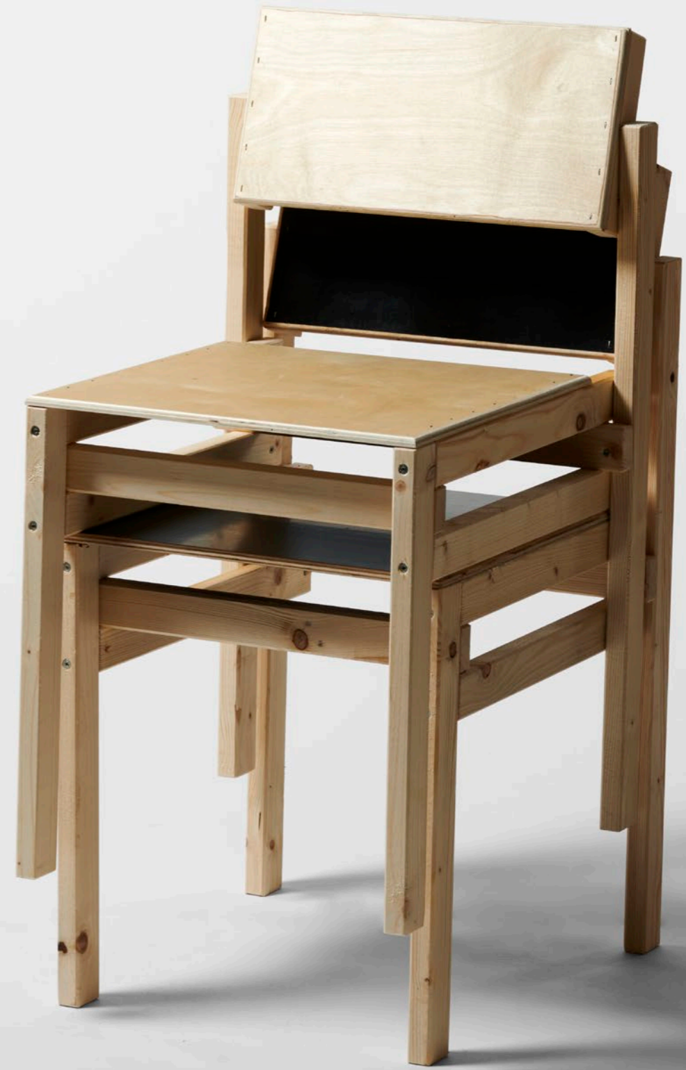
STACKABLE CHAIRS 40x52x80 CM