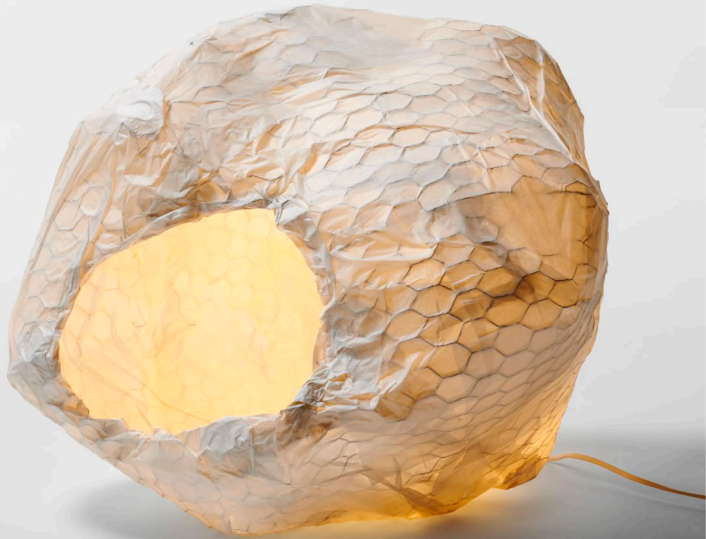
HOLLOW STONE FLOOR LAMP 45x50x52 CM