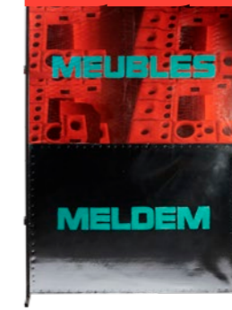
Billboard 124×35×180 cm; 11 kg

Pages 51, 52 and backcover Made, for the most part, of wood, chicken wire mesh and paper. Here, the papers used are maculatures (wasted prints, basically) from Maximage Color Combinations . It's a fancy book. Maculatures will vary. Shipping restrictions apply.