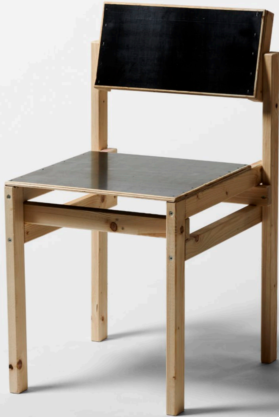
STACKABLE CHAIR (EUCALYPTUS BROWN SCREEN PRINTING PLATE) 40x52x80 CM