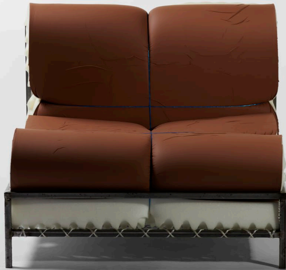
SINGLE SEATER SOFA (FAKE LEATHER) 84x92x67 CM