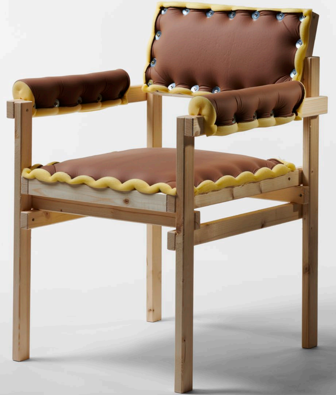
ARMCHAIR (FAKE LEATHER AND FOAM SEATING) 61x62x85 CM