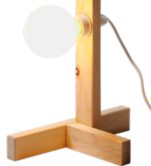
Inverted T Reading Lamp 30×17.5×30 cm; 0.6 kg Page 25

Very simple, good-looking, affordable lamps. They come with an LED light bulb.