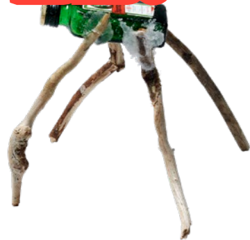
Dog Trinket (Mini Liquor) 25×15×25 cm; 0.1 kg

Pages 45, 46, cover and backcover Made of beach driftwood and mini liquor bottles found next to techno clubs and places where teenagers hang out. Yes, teens are the target audience for very small and very expensive bottles of alcohol. Alcohol type will vary. Weight and size may vary.