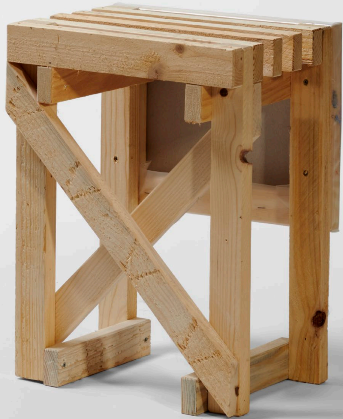
STOOL (MULTICOLOUR MM LOGO) 34x27x46 CM