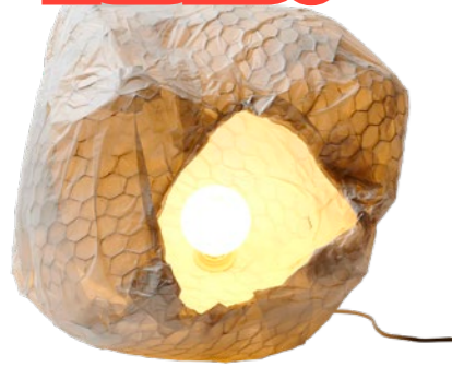
Hollow Stone Floor Lamp 45×50×52 cm; 0.7 kg Pages 19 and 20

Hello, dear, Hollow Stone Floor Lamps are made of very thin paper used to separate printing plates in print shops. It is glued on the stone-shaped chicken wire mesh with wallpaper paste. An LED light bulb is included. Please use LED light bulbs only. Weight and size may vary.