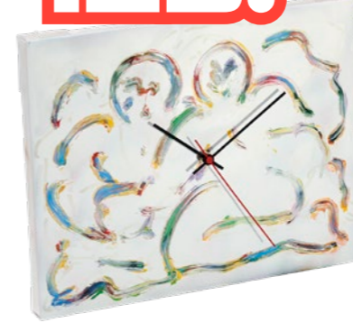
Wall Clock (Multicolour MM Logo) 33.5×4×26.5 cm; 0.7 kg Pages 47 and 50

Made of wood, used plastic bags and recycled cardboard. Also, acrylics are used. They contain clockwork run by one AA battery (not included). Logo will vary.