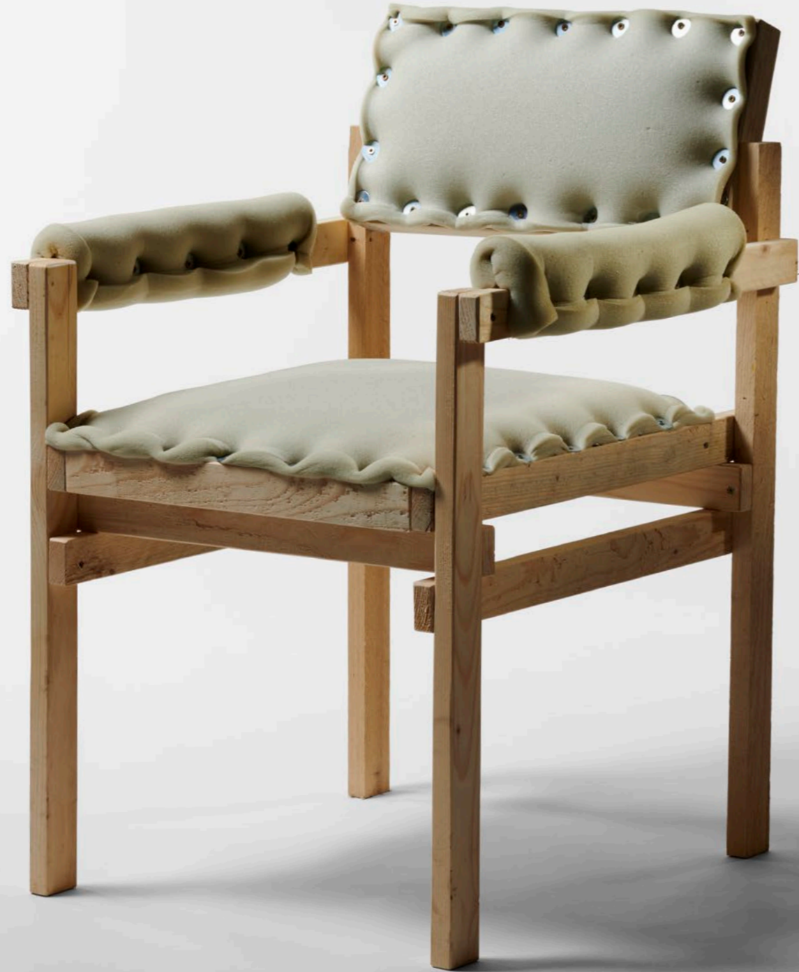
ARMCHAIR (EXPOSED FOAM SEATING) 61x62x85 CM